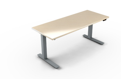
Sit/Stand Table Electric Height Adjustable