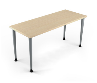
Standard Table Tapered Leg

Working at your kitchen table not cutting it anymore? Need to upgrade? Neutral Posture has everything you need to create the ideal home office.