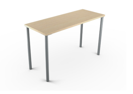
Sit/Stand Table Stand-biased