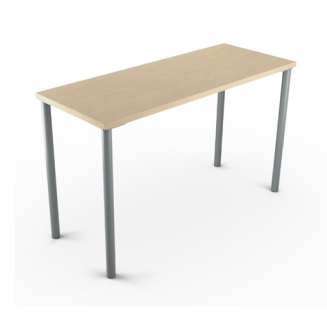
Sit/Stand Table Stand-biased

In search of the ultimate sit/ stand desk? Then the standbiased solution is the option for you. A stand-biased desk is already at standing height. You simply raise your chair to match. The key is Neutral Posture's patented NeXtep®, which provides a flat surface for your feet ensuring you are comfortable while you are sitting.