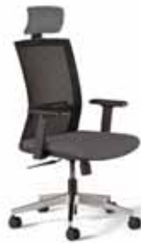
REN4604-H-D3-B24 45.5H x 26W x 26D