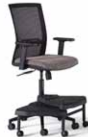
REN4604-D3-L4-R22 41H x 30W x 30D