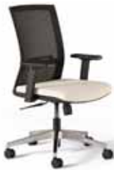
REN4604-D3-B24 37H x 26W x 26D