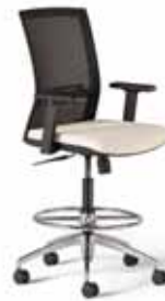
REN4604-D3-B24-L4-R2 41H x 26W x 26D