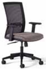
REN4604-D3 37H x 26W x 26D