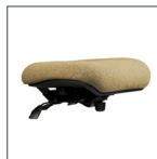
8 Seat Large, Minimal Contour