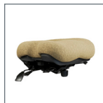
6 Seat Medium, Moderate Contour