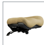
9 Seat Large, Deep Contour