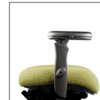
P Arm 360° Swivel