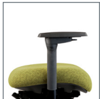
0 Arm 5-way 360°