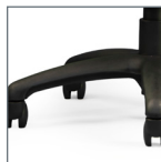
B12 28" Black