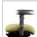
7 Arm Oversized Fabric/ Leather Arm Pads