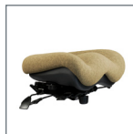
7 Seat Medium, Deep Contour