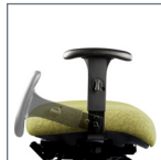
4 Arm Swing