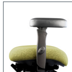
6 Arm Oversized Black Vinyl Arm Pads