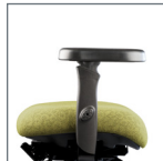
3 Arm 360° Swivel w/ Oversized Urethane