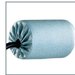
2 AbRest™ Upholstered