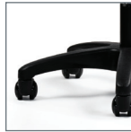
B22 22" black