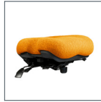
6 Seat Medium Seat, Moderate Contour