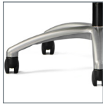
B8 27" Brushed Aluminum