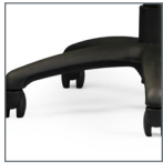
B0 Standard 26" Black