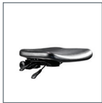
5 Seat Urethane Seat