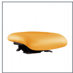
3 Seat Medium Seat