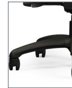
B12 28" Black