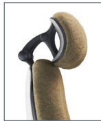
H4 Dual Pivot 8 back only