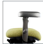
7 Arm Oversized Fabric/ Leather Arm Pads