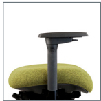
0 Arm 5-way 360°