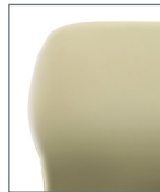
S5 Ultraleather™ 1 back only