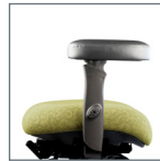
6 Arm Oversized Black Vinyl Arm Pads