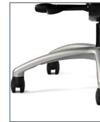
B8 27" Brushed Aluminum