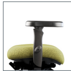
3 Arm 360° Swivel w/ Oversized Urethane