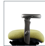
P Arm 360° Swivel