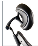
H5 Dual Pivot 1 back only