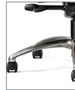
B6 26" Polished Aluminum