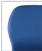
S1 or S2 Grade C or 1 ( S1 ) Grade 2 ( S2 ) 1 back only