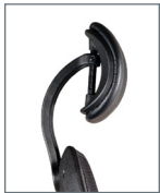
HE Height Adjustable 1 back only